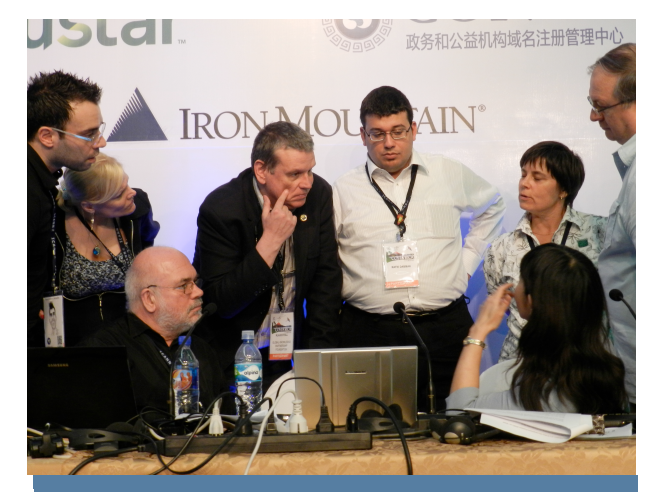
What We Do

We have over 300 members in 70 countries across all five ICANN-recognized geographic regions. Our members include individuals and non-profit organizations involved in civil liberties and human rights, Internet freedom, consumer protection, education, research, development, and many other areas of public policy advocacy.